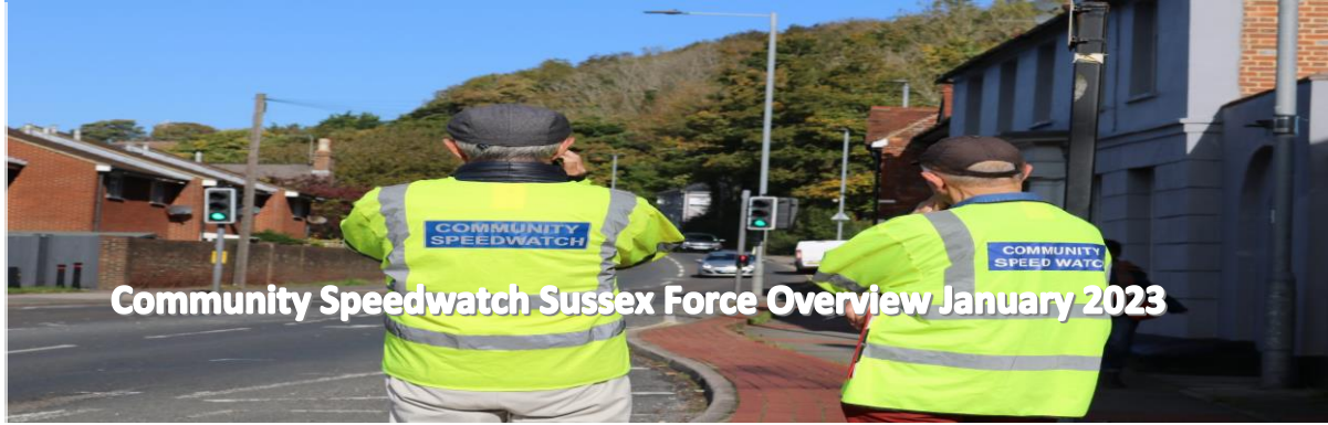
Community Speedwatch Sussex Force Overview January 2023