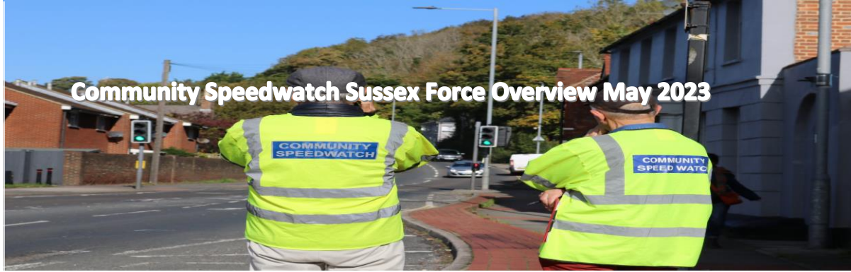
Community Speedwatch Sussex Force Overview May 2023